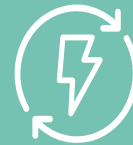
Energy Generation (Traditional and Biomass)