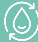
Industrial Water Treatment and Reuse