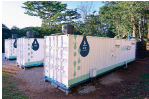
NIROBOX™ desalination plant The industry's smallest overall footprint