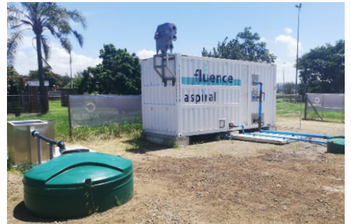
Aspiral™ MABR-based wastewater treatment Effluent meets stringent water reuse standards