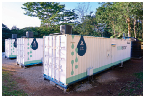
NIROBOX™ Smart Packaged desalination plant