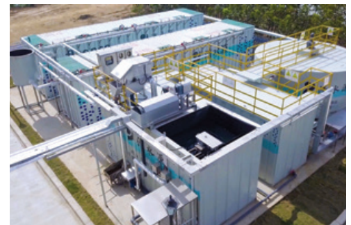
Aspiral™ Smart Packaged MABR-based wastewater treatment